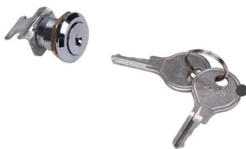
LOCK WITH KEY, LOCK D